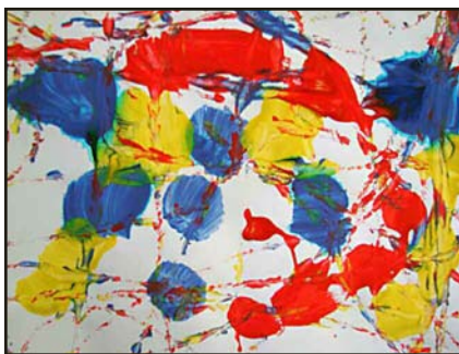
Dalton age 3 1/2