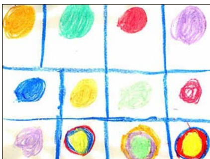
Chalk Art by Madisyn, almost 7 (top and center drawings), and Kira, age 7 (bottom drawing).

The bottom two drawings are based on the style of Russian abstract painter Wassily Kandinsky