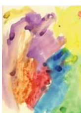
Scoie D., age 5