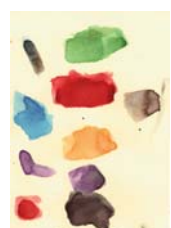
Paige S., age 3

We noticed the wonderful colors, shapes and patterns in these pieces of art and then we used watercolors to make some of our own amazing paintings. The children took turns sewing and lacing the pieces together to make the quilted art projects on the walls in the South Room.