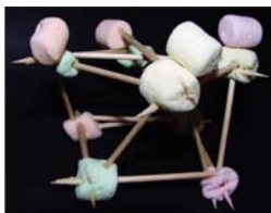
One of Hunter's marshmallow and toothpick structures.

Let me tell you about some of the evening conversations and activities that have taken place at my house after a day of preschool at Dimensions.