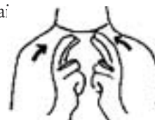
Sign for "squirrel"

Walks outdoors are great for young children to explore the wonders of nature and to experience using all of their senses. We can't wait to go out again!