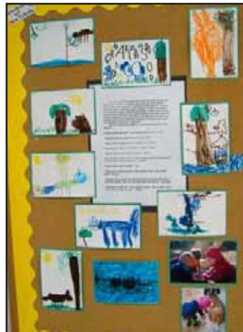
Squirrel documentation by children, teachers.

Ever since a cold day in December, when Ava looked up into the oak tree that stands in our