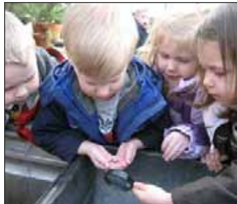
Everyone wants to examine the worm!

wonderful black dirt. (This dirt is used as planting soil in the greenhouse.)