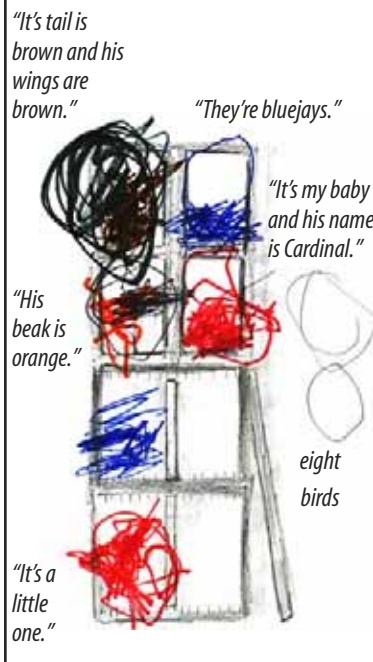
"It's tail is brown and his wings are brown."