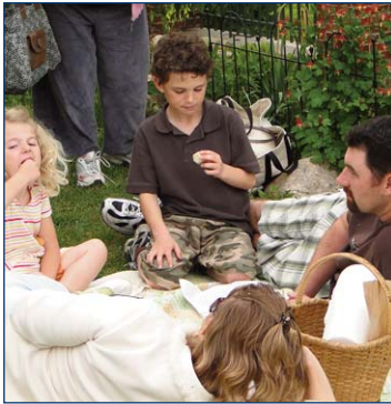
Hanging out at the year-end Dimensions’ picnic.

It’s time to celebrate YOU! Family involvement is a key component that contributes to the on-going success of Dimensions Early Education Programs. The partnerships that are created between parents, other family members, teachers and our nearby community help to create a unique